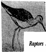
Raptors Save the Day