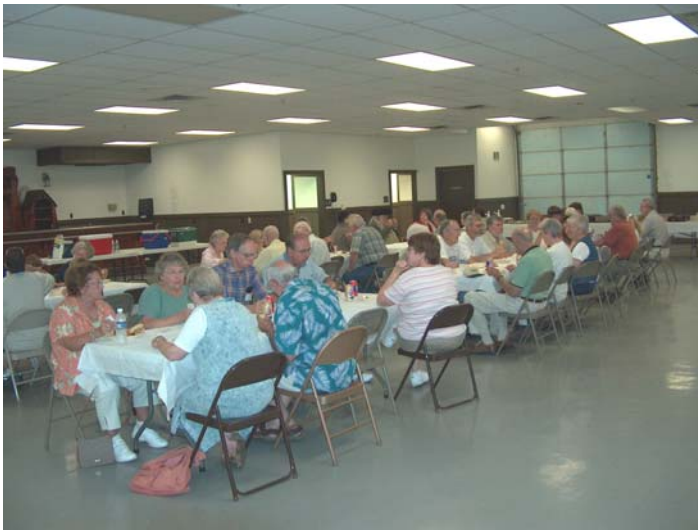
Attendees at the Oxbow Birthday Picnic sit in air conditioned Agner Hall to chow down on great picnic fare. By picnic's end 88 members came to eat and even more came for just the tours and displays.