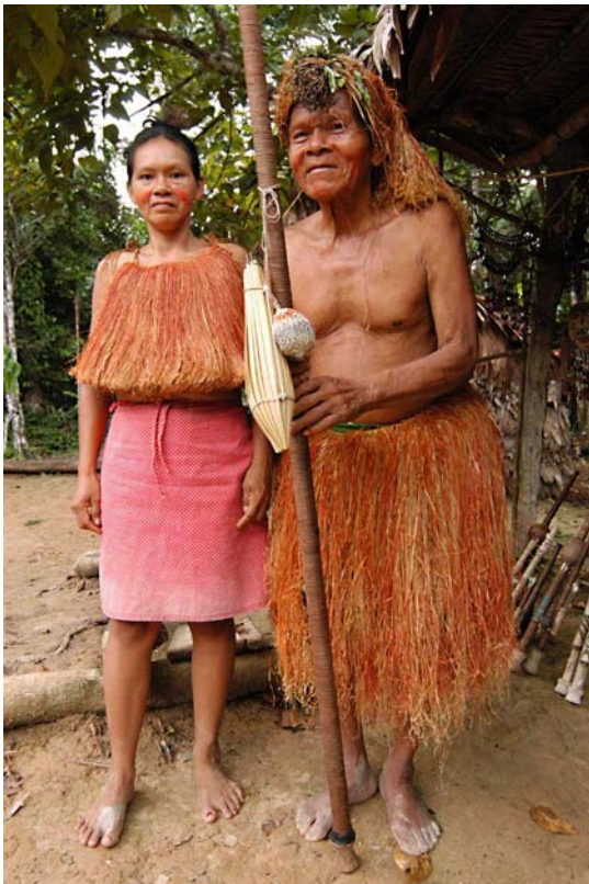
Man and woman of the Yagua tribe in the Amazon The November members meeting will be held at Sharon Centre and feature a talk on “The Peruvian Amazon”. See full details on page 4