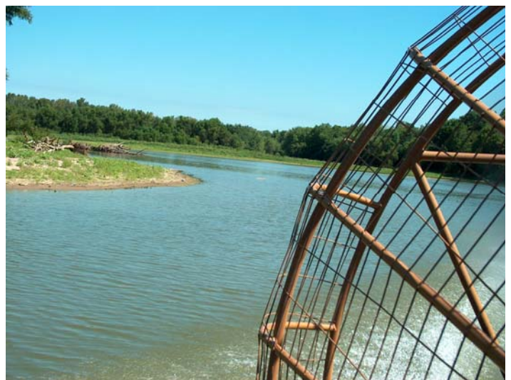
The CINERGY airboat leaves the Shawnee Lookout boat entrance slough behind as it skims along down the Great Miami River.