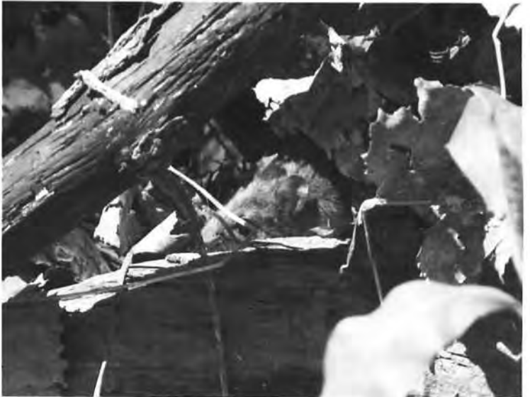
I don't know why I am so popular. I am just a mouse whose house was jostled about.