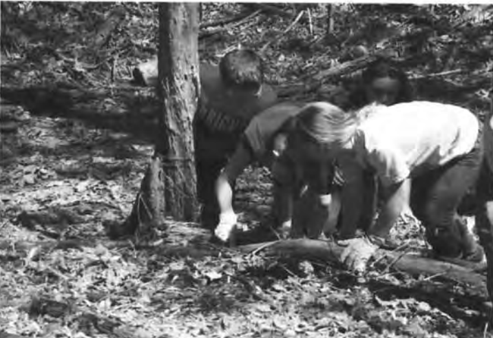
What draws such a crowd of curious onlookers? What could be so popular? We'll see in the photo to the right.