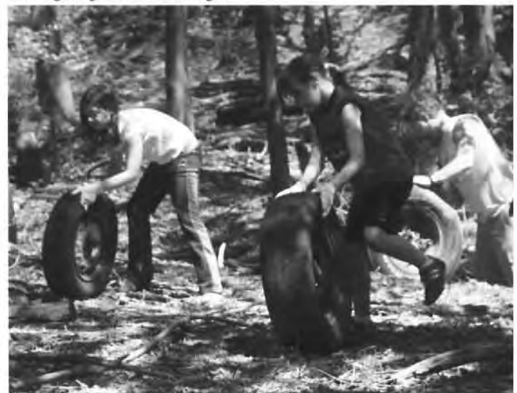
The Outdoor Club corralled 170 tires and found themselves asking that age old question of, "Are tires supposed to roll up hill?"