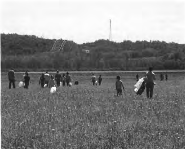
Students and Parents of Bright Elementary School's Outdoor Club sponsored by teacher Cathy Mund strike out across the Oxbow fields on a quest of picking up trash in the Mercer Pond area.