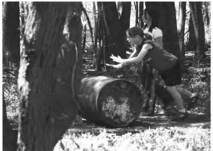
Tires are not the only things that the explorers from the Bright Elementary Outdoor Club were able to roll out of the woods. This rusted out 55 gallon drum was later found to harbor a nest of mice. That must have been some Merry-go-round ride for those mice.