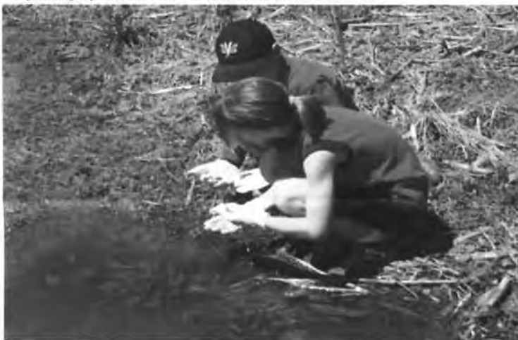
Two Bright Elementary students stop to examine turtles and frogs trapped in pools by receding flood waters. This is what "getting out" in nature is all about. There can be a surprise in every puddle.