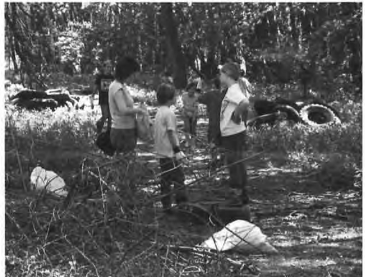
Students from Bright Elementary School Outdoor Club discuss strategy. What's next? There was no lack of trash for anyone. The problem was figuring out where to begin.