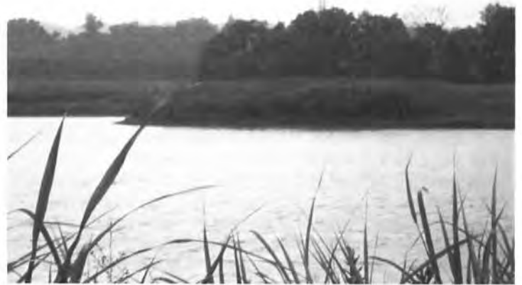
Osprey Lake