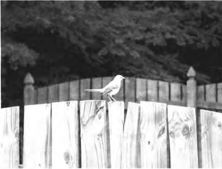
"Gregory Pecker" pauses to see where he might find the next meal for his second brood of young. See story on page 5.