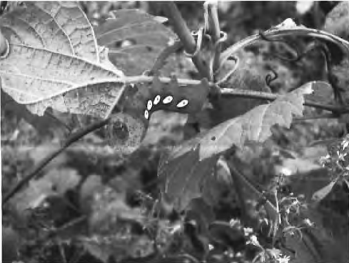
Pandora Sphinx Moth Caterpillar