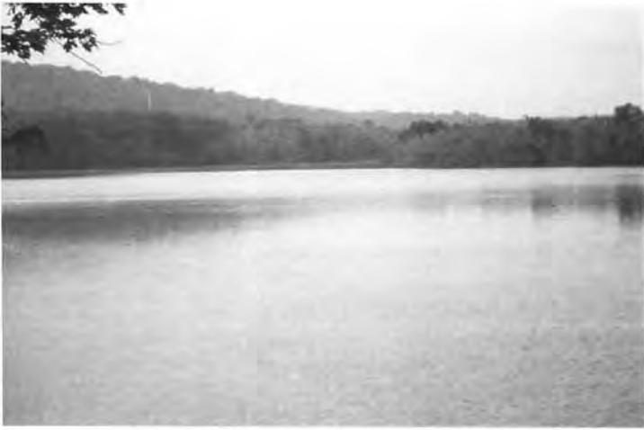
Towards Juno Pond along Oxbow Lake from the overlook