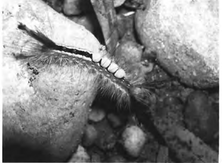
White-marked Tussock Moth Caterpillar