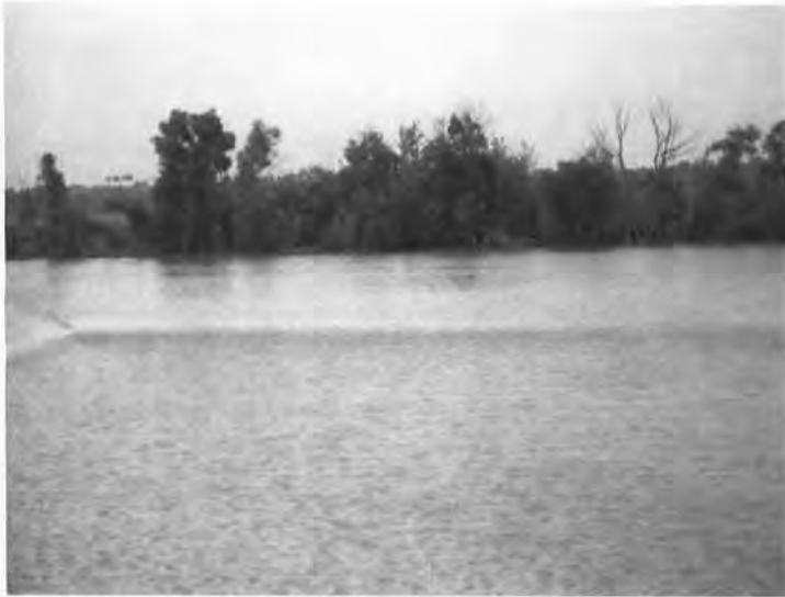
From the overlook, looking toward Mercer Pond across Oxbow Lake