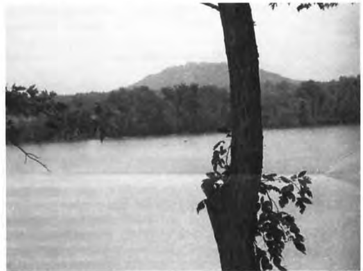
View of Shawnee Lookout across Oxbow Pond taken from the overlook