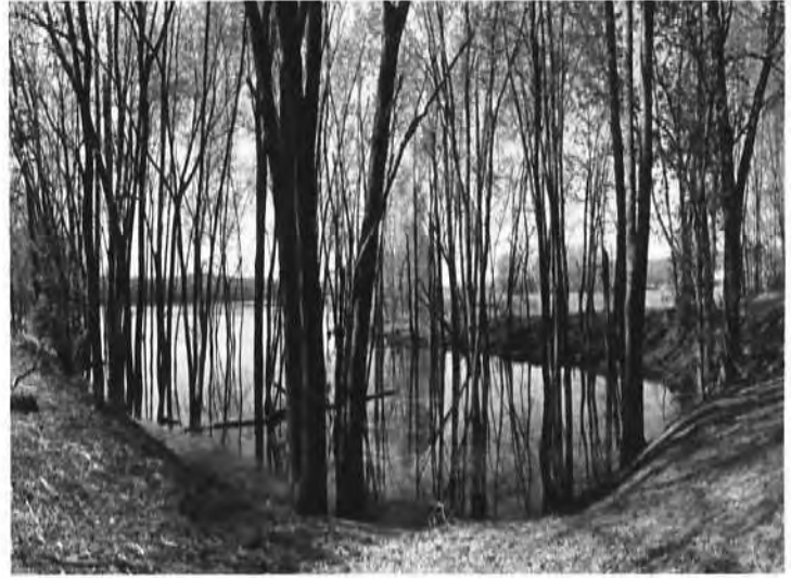
Juno Pond