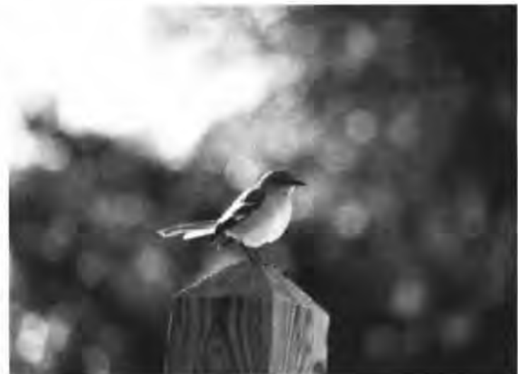
A Northern Mockingbird is a common backyard visitor in the southern half of the United States and is very well habituated to humans.