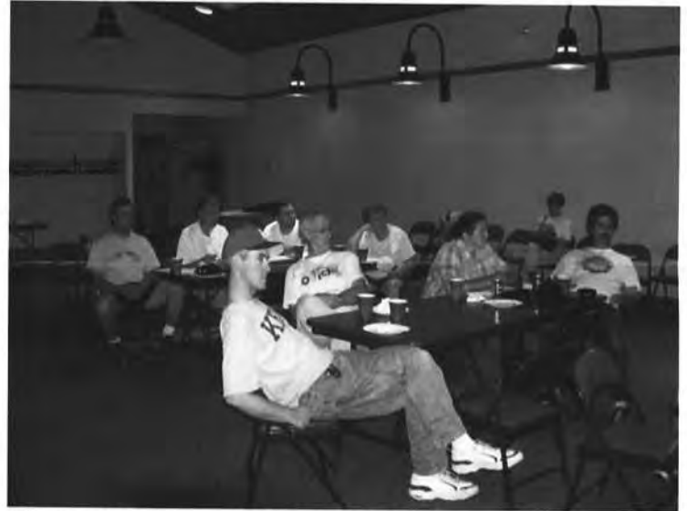
The meeting room at the Sharon Woods Centre provided an excellent finishing place for the tally with sufficient room to kick back and relax after 24 hours of birding and compare birding adventures.