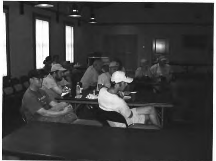
After devouring Pizza, pop, veggies and cookies Birdathon participants put together the grand list by comparing all lists against the winning list.