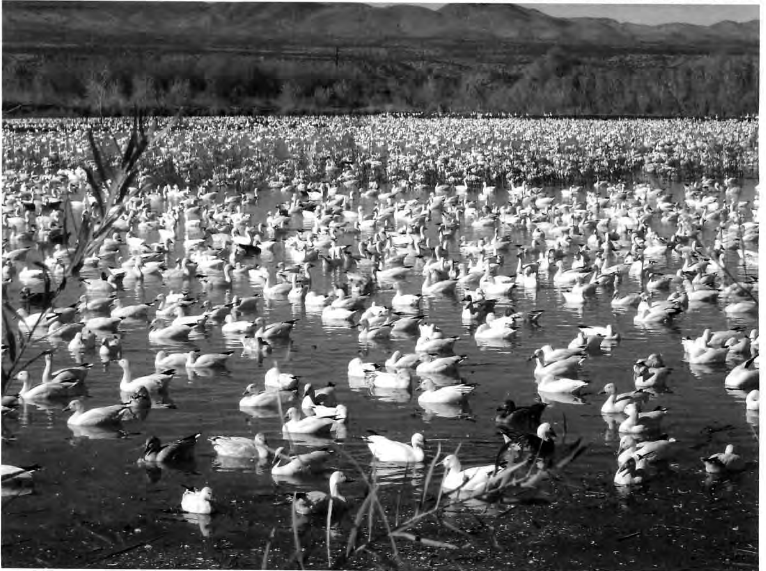
A carpet of snow geese cover a marsh area at Bosque del Apache National Wildlife Refuge.