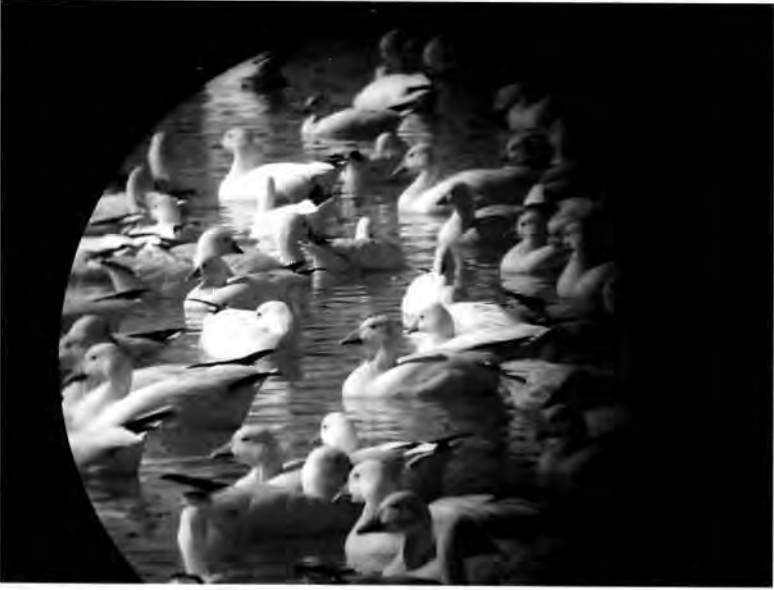
Snow geese fill the view at Bosque del Apache National Wildlife Refuge. (photo by Therese and Jeanne Bocklage)

A Sandhill Crane escapes the bustle of the refuge for a little solitude in drainage ditch. (photo by Therese and Jeanne Bocklage)