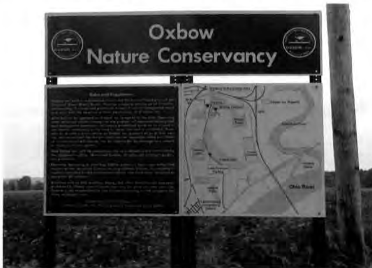
Some of you traveling to the far reaches of the Oxbow area may have noticed the new sign placed at the Argosy entrance to the Oxbow. It is a duplicate of the sign at the Hardintown entrance and is designed to inform visitors to the Argosy side of the rules for behavior while visiting the Oxbow area.