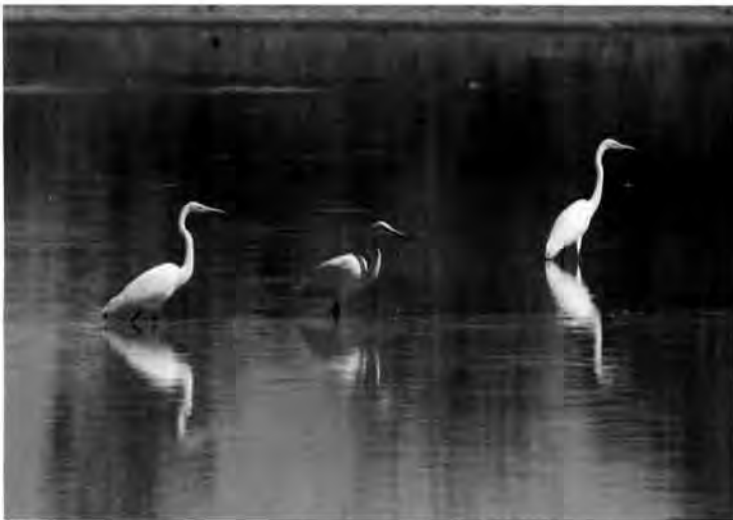
Three Great Egrets rest in the shallows of Oxbow Lake where the "fishin' is easy" during the drought of the summer of 2007.