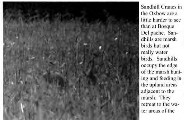
Sandhill Cranes in the Oxbow are a little harder to see than at Bosque Del pache. Sandhills are marsh birds but not really water birds. Sandhills occupy the edge of the marsh hunting and feeding in the upland areas adjacent to the marsh. They retreat to the water areas of the marsh for breeding and security. This photo shows the birds feeding in standing corn along the edge of Oxbow Lake. These wary birds seldom allow the close approach of any human being on foot.