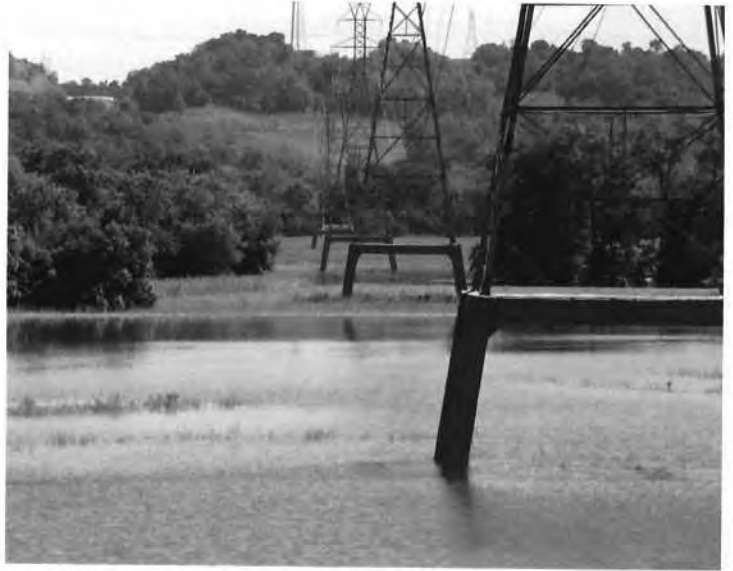
A telephoto shot of the high tension power lines running through Oxbow, taken from the levee, shows the concrete footers of the towers standing in water. Normally these are high and dry. Again this is only at 50 feet as measured in Cincinnati.