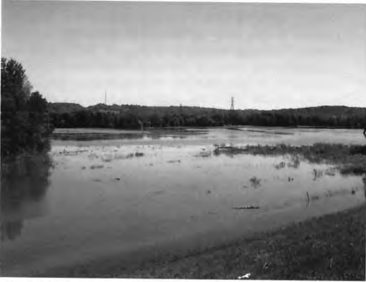
The Oxbow area essentially fills up with the river level at 50 feet measured at Cincinnati. This photo taken from the levee along US Highway 50 shows the water lapping at the foot of the levee. The Oxbow Lake Road lies just this side of the tree line while Oxbow Lake at normal level would lie just on the other side of the tree line.