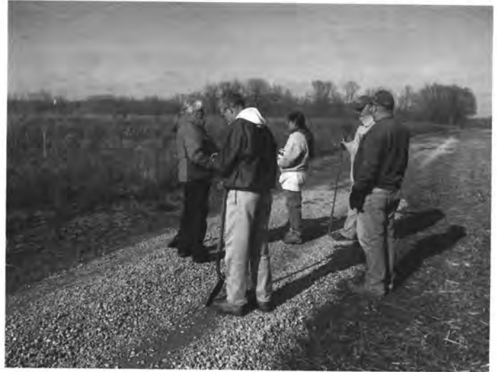
A much smaller group of volunteers gathered for the second attempt to burn the Jackpot Pond prairie on December 5th with more success.