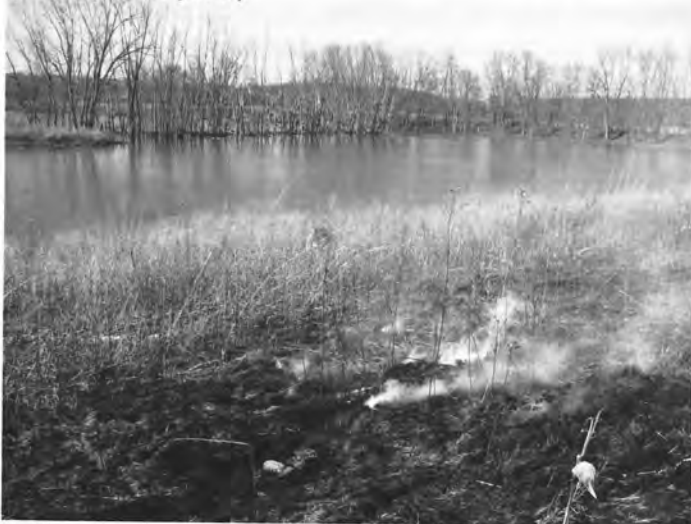
The last vestiges of the Jackpot Pond burn work their way down hill against the wind. Soon they will extinguish themselves or be extinguished by volunteers.