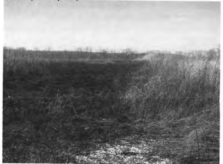
The burned area of the Jackpot Pond prairie looking from where the fire stopped toward where the fire began. Only about 1/3 of the prairie caught fire during the burn attempt. Other methods will have to be employed to continue the control of succession in the area.