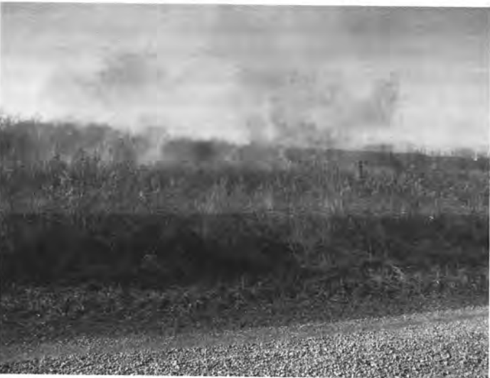
On December 5th, the second attempt to burn the prairie at Jackpot Pond was a little more successful with about 1/3 of the prairie burned.