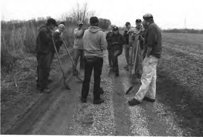
Some of the many volunteers gathered on November 21st to help with the prairie burn at Jackpot Pond. Unfortunately almost nothing caught fire and there was little for people to do.