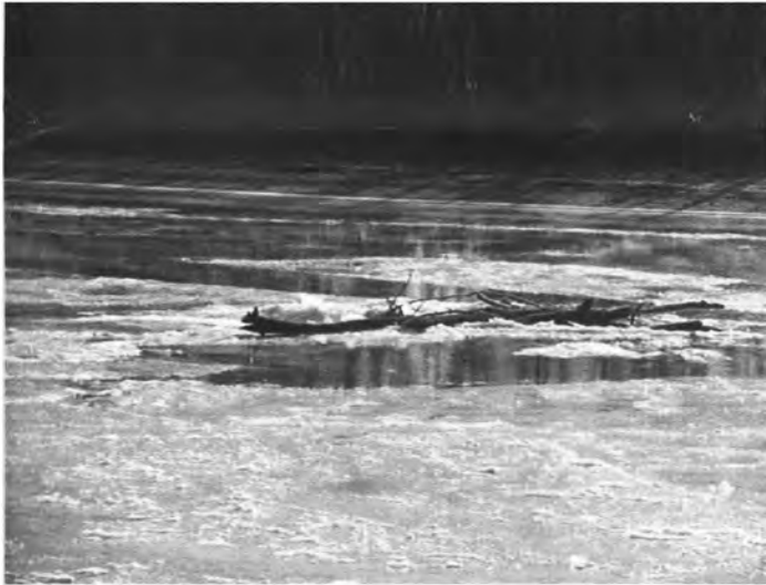
Ice sheets float down the Great Miami River and pile up behind a snag creating a small ice jam.