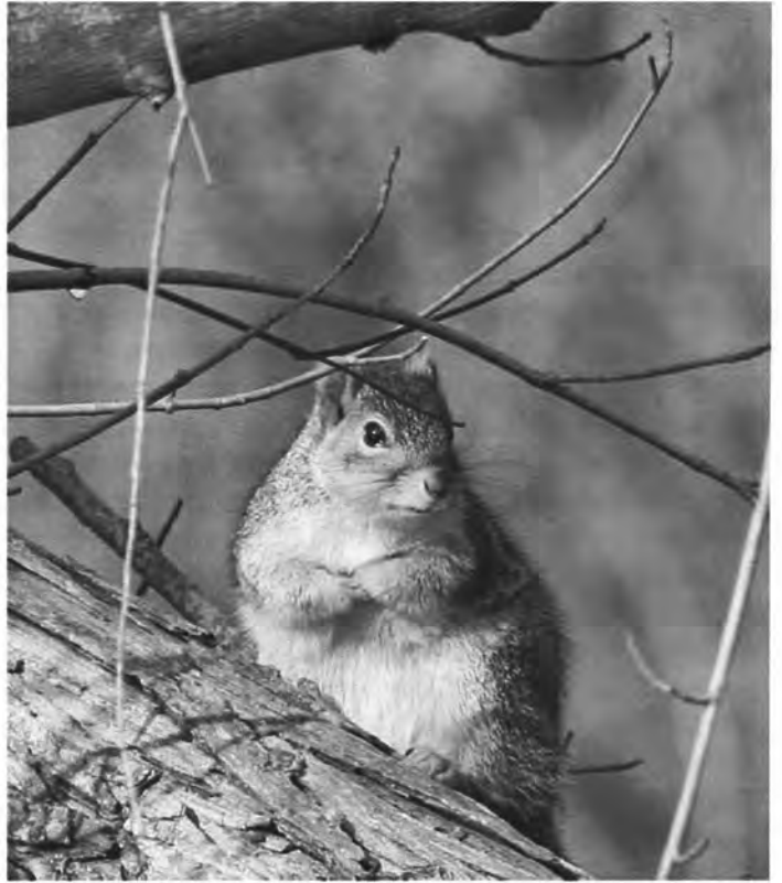
A Fox Squirrel contemplates the snow and ice in the Oxbow and tries to remember under which ice drift and pile of snow he buried that nut.