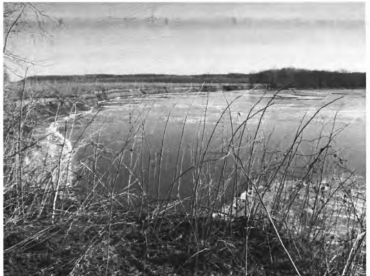
Ice sheets floating down the Great Miami River crash into the outside bend of a meander turn at the mouth of Double Lick Creek. Ice sheets breaking up and grinding against the bank cut at the soil like millions of knives. Fortunately the bank sand is frozen or the soil would be ripped apart.