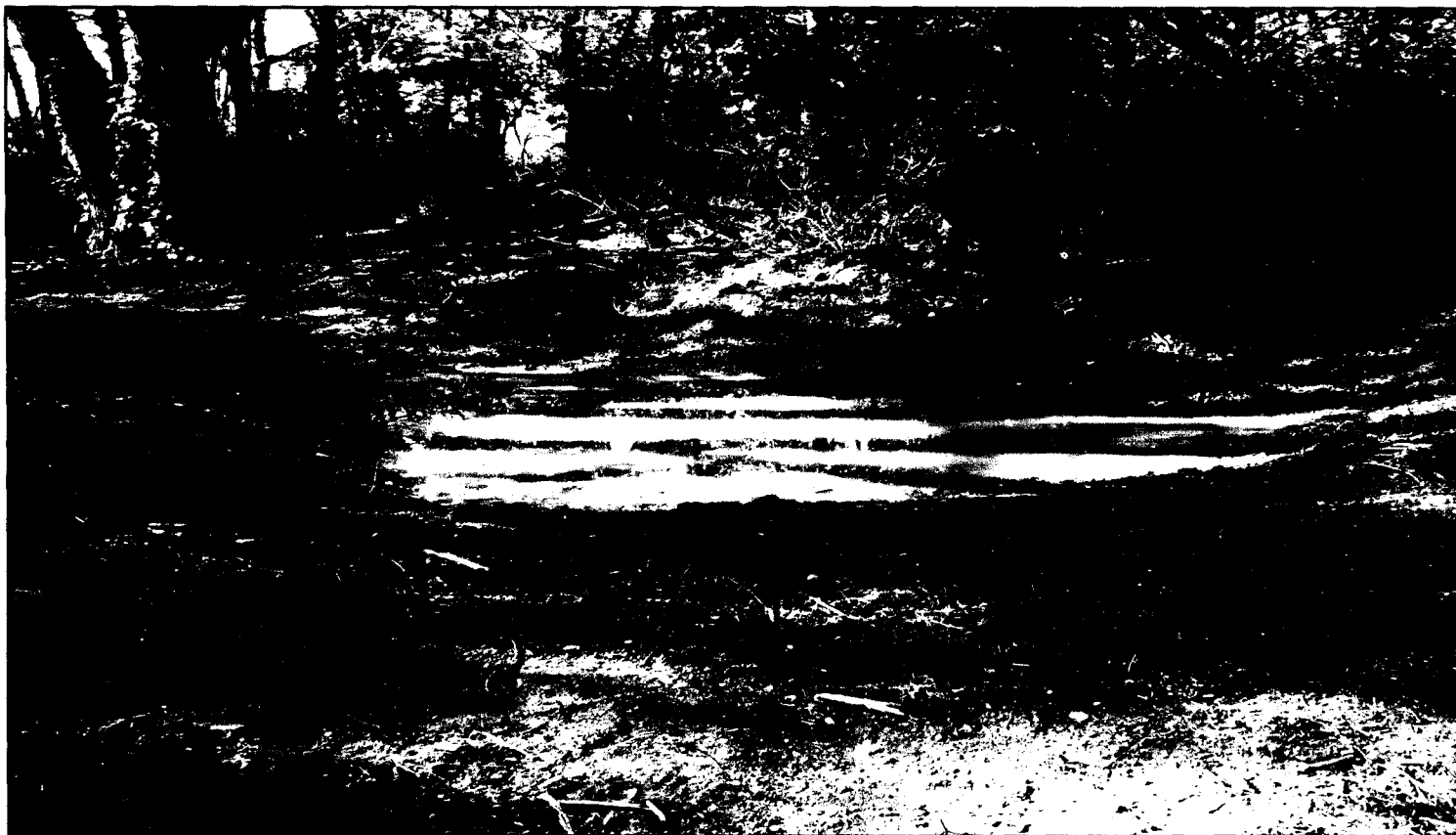
New vernal pool constructed near the entrance parking area. This pool nearest the road seems like a simple open mud hole but is really a highly technical synthetic pool. First the area the pool is built in is highly permeable and will not normally hold water. To change this the area was first dug out deeper than the finished pool and lined with a high tech synthetic liner that will not crack or be easily penetrated. This allows the pond to hold water. Next the liner is covered with sand and then with dirt and clay to make a bottom for the pond.