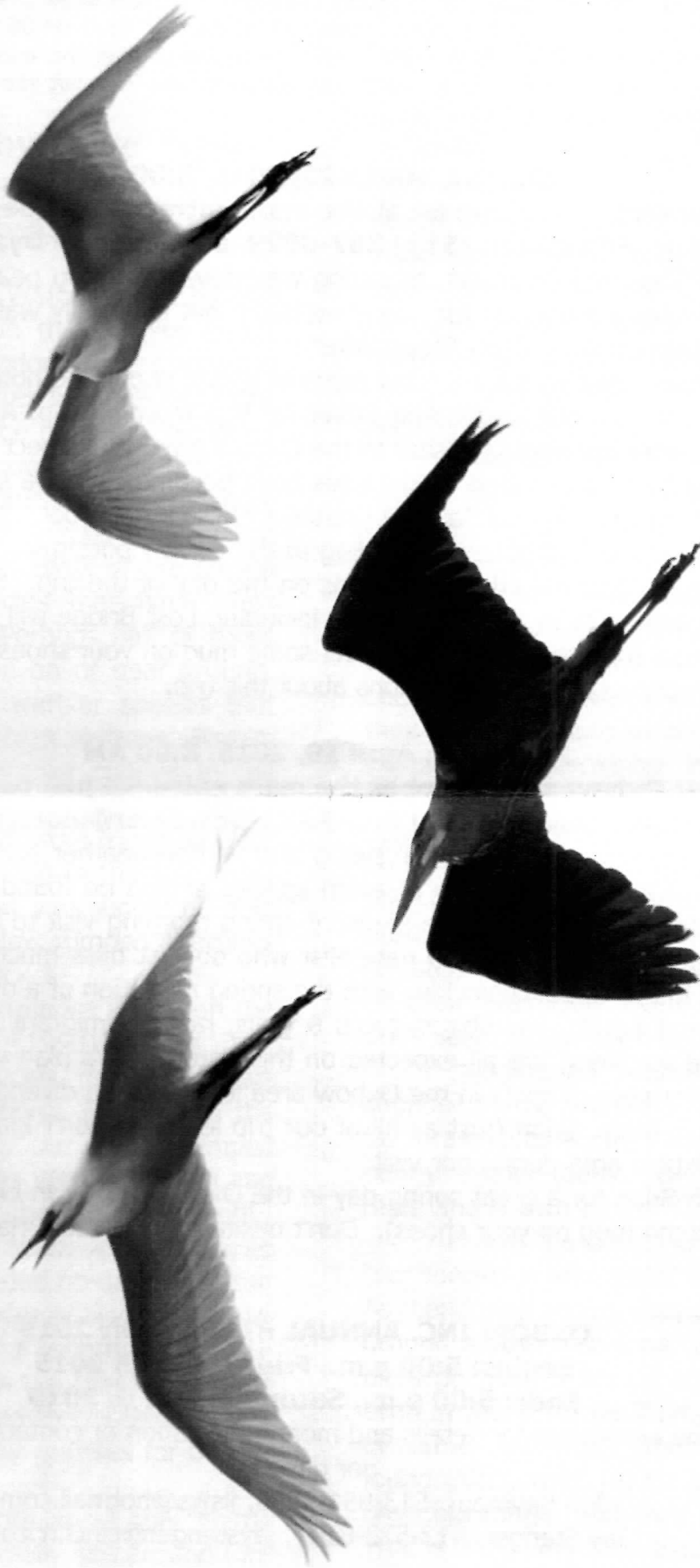
While spectacular blue skies and brilliant sun light are uniformly desired for photography, Sometimes the odd light can make the photo spectacular. A cloudy day in the Oxbow with two Great Egrets flanking a Great Blue Heron.