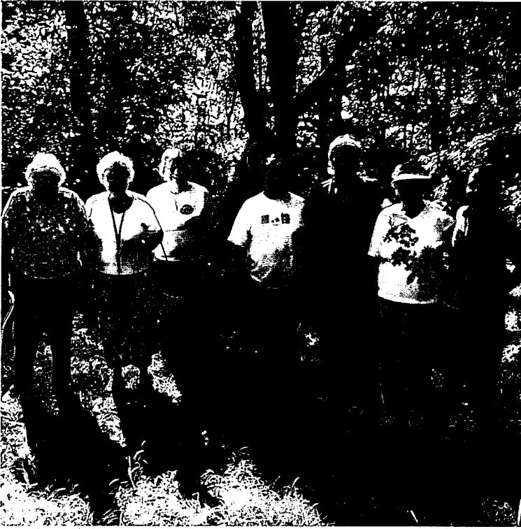
The Clovermook Garden Club enjoys a personal guided tour to the Oxbow