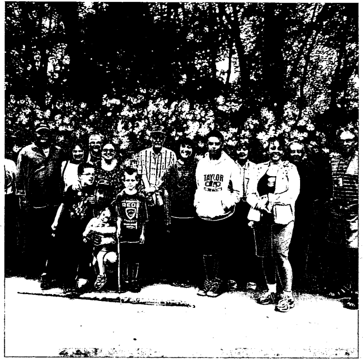
The Sunday Great Outdoor Weekend hikers crowd in front of a bed of blooming Jerusalem Artichoke.

"This place is Zen like - I feel relaxed here."