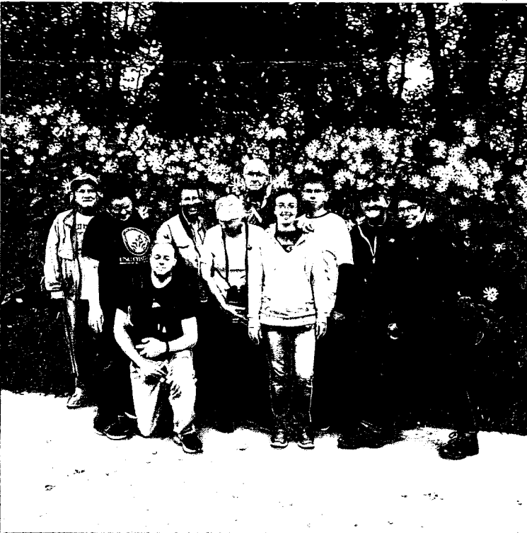
The Saturday Great Outdoor Weekend hikers (minus a few stragglers) enjoy a beautiful evening in the Oxbow.

"This place is Zen like - I feel relaxed here."