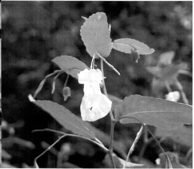
Pale Jewel Weed likes the shade of the woods and seems a shy flower but has another name that seems to give warning to a duplicitous nature - touch-me-not.