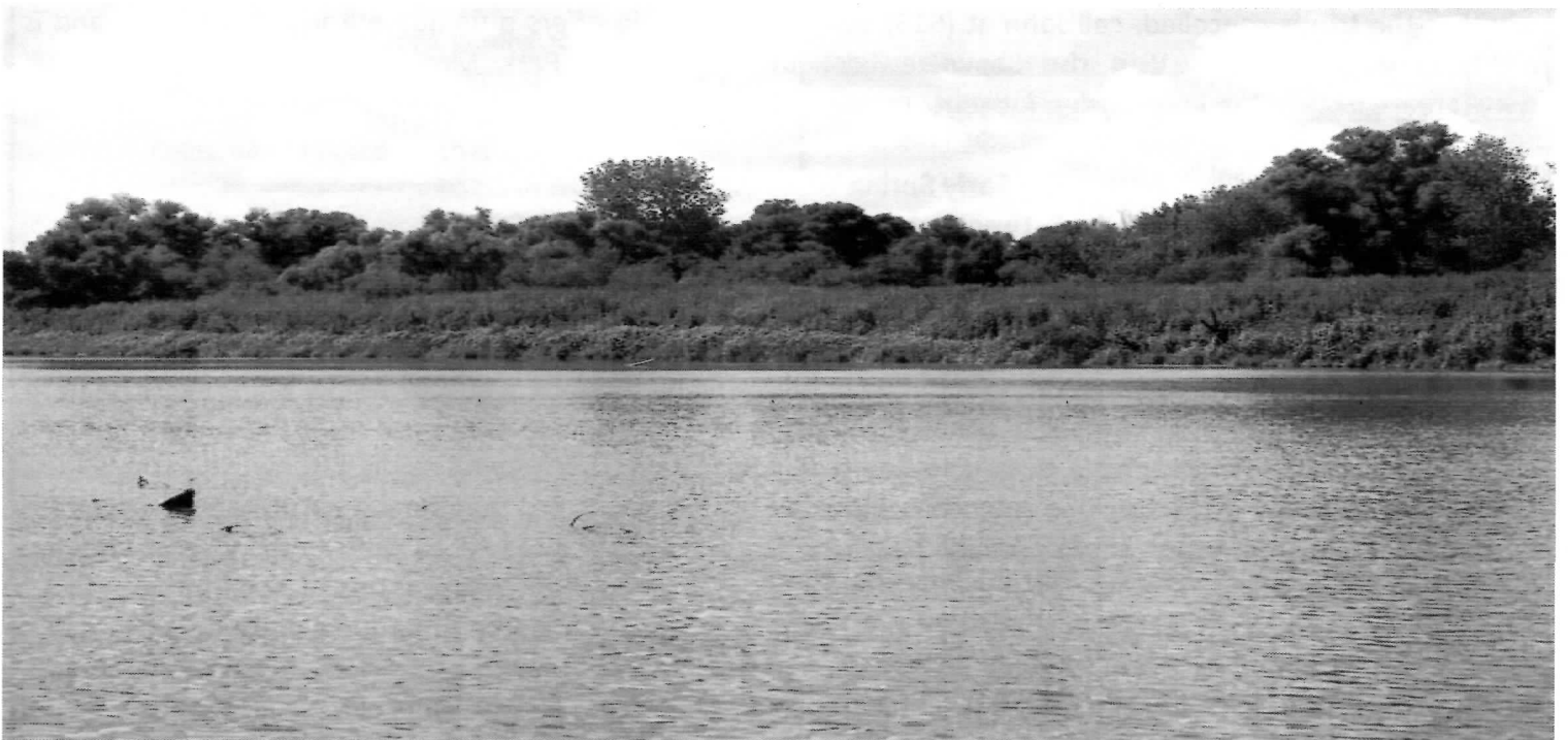
On the other side of the river soil from Dayton or maybe the Hamilton area is deposited and forms a place where little seeds from little plants can get a foothold. If you view across the river to where the new soil is building you see new grasses and forbes near the shore, shrubs back further, then small trees, and finally the furthest from the shore in the oldest soil are the tallest trees.