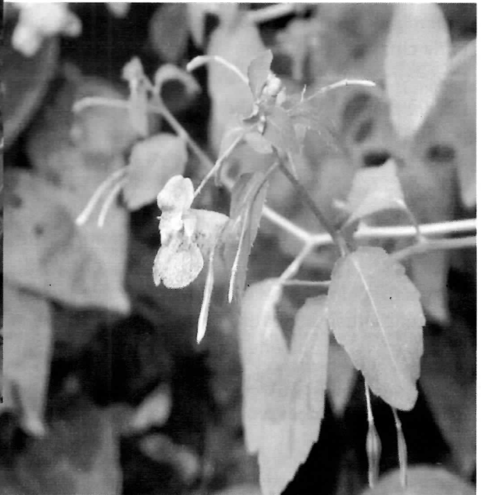
Spotted Jewel Weed, like its pale cousin, has an exploding seed pod that sprays seed on the forest floor when touched by a passer-by.