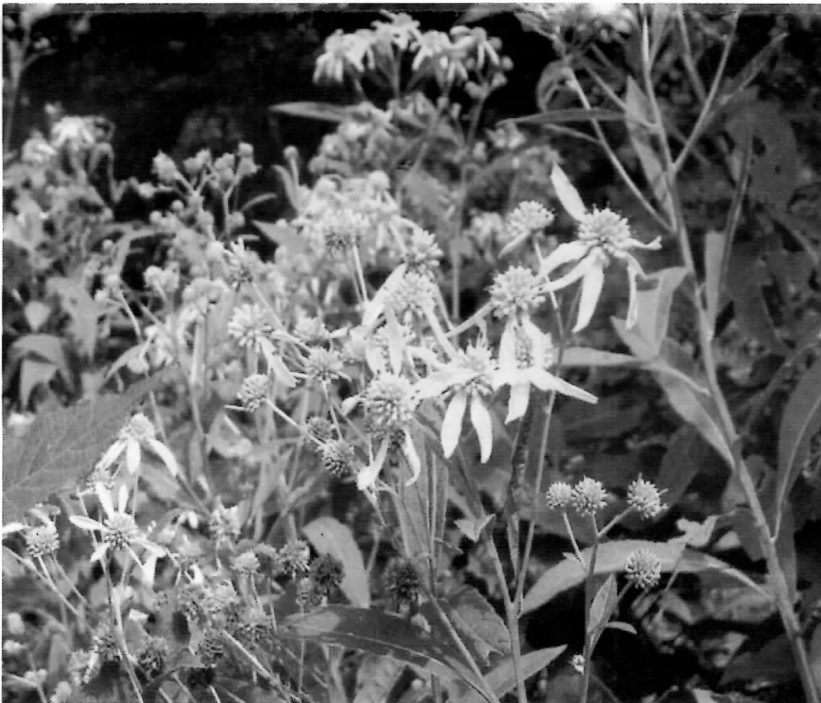
Wingstem is an odd large plant with a spindly look with lots of big flowers (sunflower family) but is easily identified by the presence of a four-sided stem.