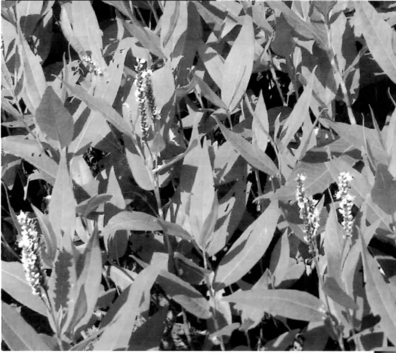
Aquatic Smartweed covers many acres of the shallow area of Oxbow Lake and provides cover for breeding of frogs, fish and many other aquatic species. It is also a favored hunting ground for several species of herons in the Oxbow.

Now that winter is upon us we like to think back to past beauties and forward to the beauties yet to come. Here are four beauties that bring comfort to our winter blahs.