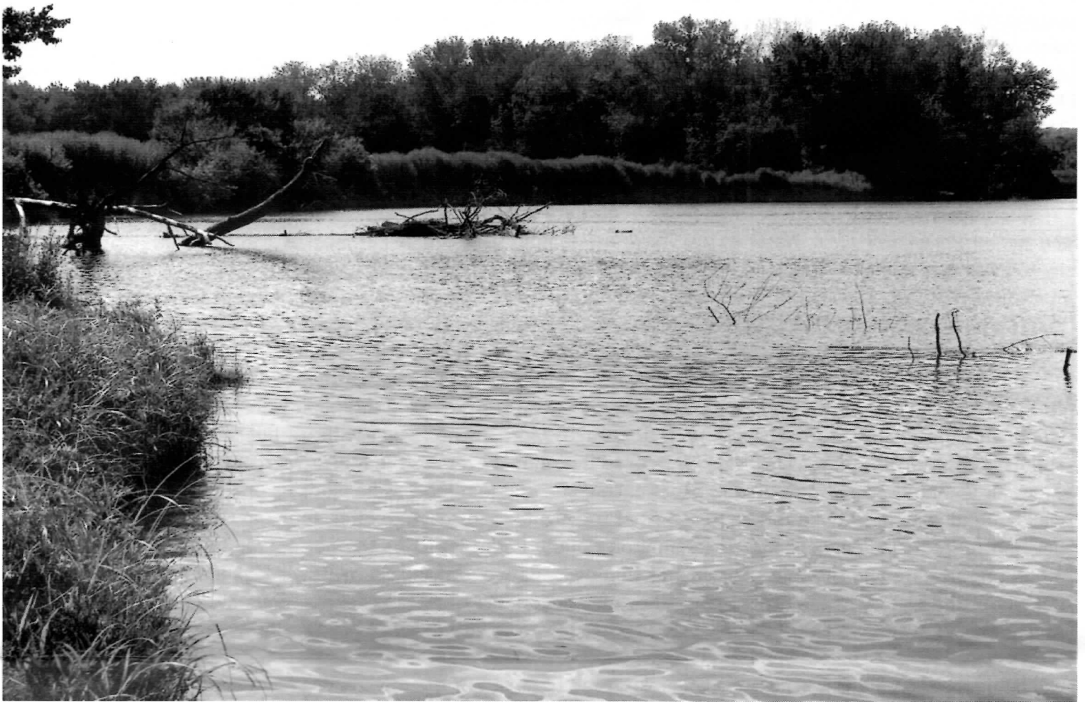
The Great Miami River makes it's final turn before entering the Ohio River. As it does it carves the soil away from Oxbow property and probably deposits it somewhere in Kentucky or Illinois.